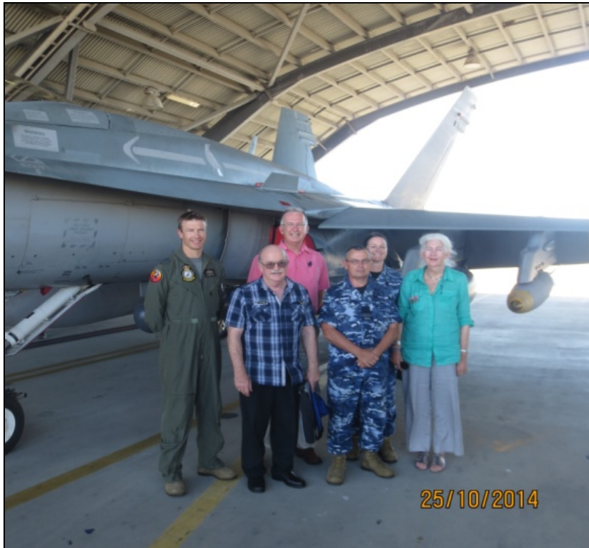
75 Squadron Association Committee 2014-15