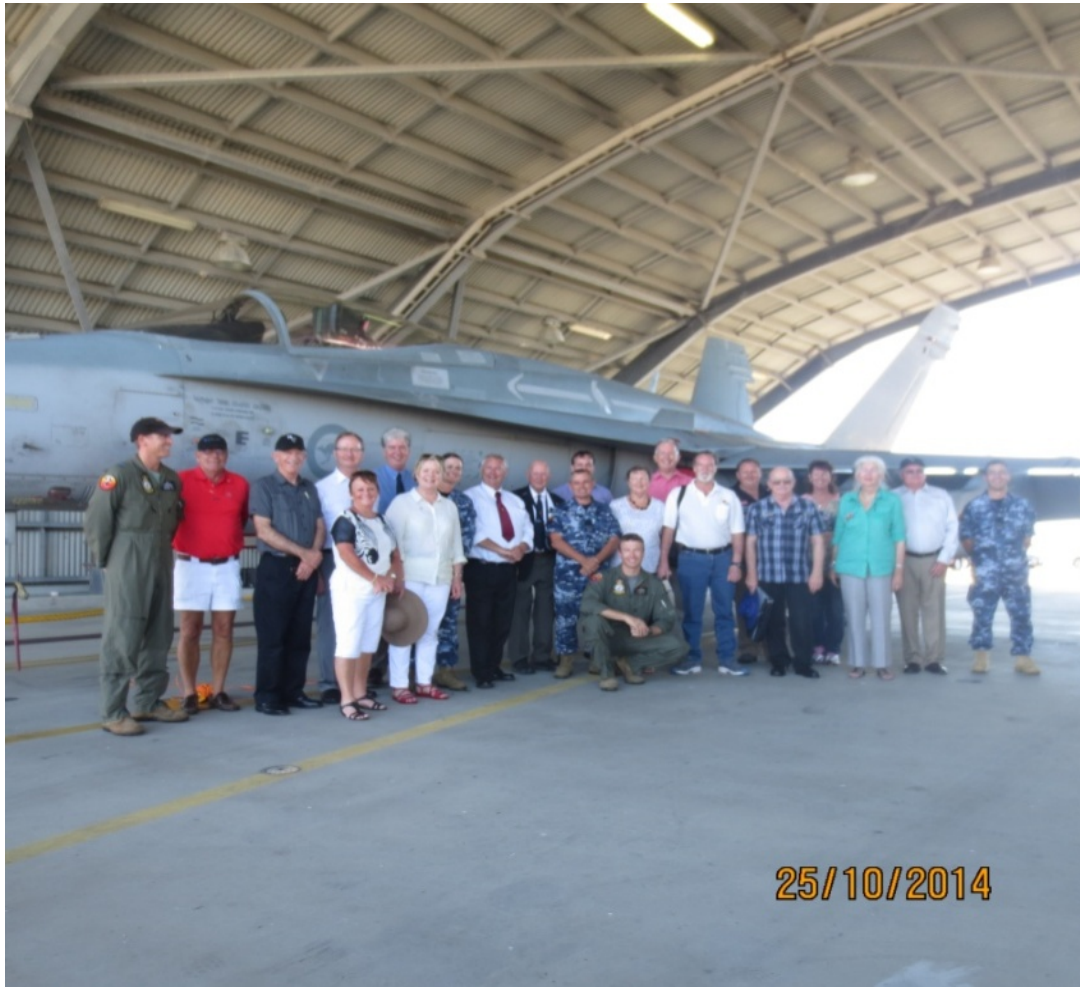
75 Squadron Association members in Townsville Oct 2014