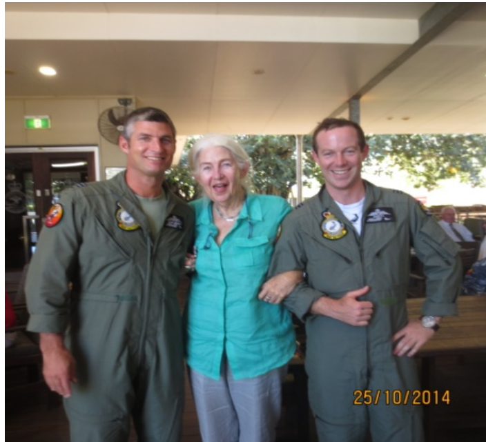
Lunch at the Officers' Mess

After lunch there was a screening of the ABC documentary “44 Days”, presented by Geoffrey Robertson on screen. It’s an account of those dark days in early 1942 when 75 Squadron was fighting the Japanese over the skies of Port Moresby. We were told that the pilots watching were very moved by what happened all those years ago.