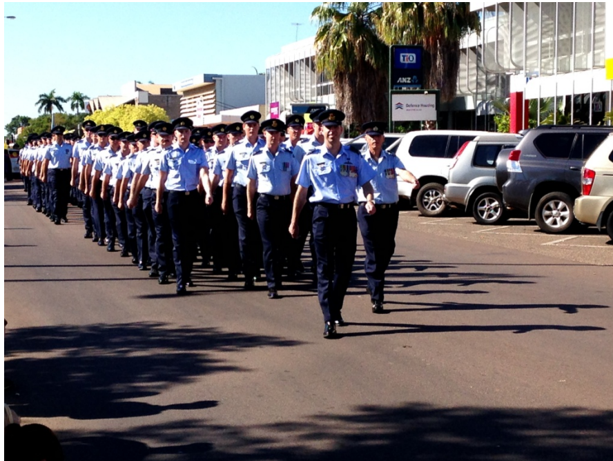
ANZAC Day March in Katherine – 25 Apr 16

Exercise Arnhem Thunder and exercise Classic Cannon kept the Squadron on its toes throughout May and June. These planning and weapons exercises, along with an advanced air-to-air concentration period in-between, stretched us to our training limits last month, however by doing so we generated several category B pilot upgrades; one of the highest accomplishments our young fighter pilots can achieve. On the 22 nd of May 75 Squadron opened its doors to the entire Tindal Base including families, for an open day. There were displays by the search and rescue helicopter team, police dogs, security forces, as well as simulator, aircraft, weapons, and support equipment demonstrations, plus a superb flying handling display at the end. The day was primarily focused upon our families and kids, but between you and me, I think many of the 17 Squadron staff from the other end of the Base just wanted to be a Magpie for a day!