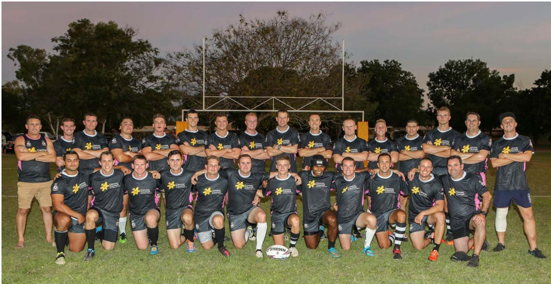
75 Squadron Rugby League Team – 03 Jun 16