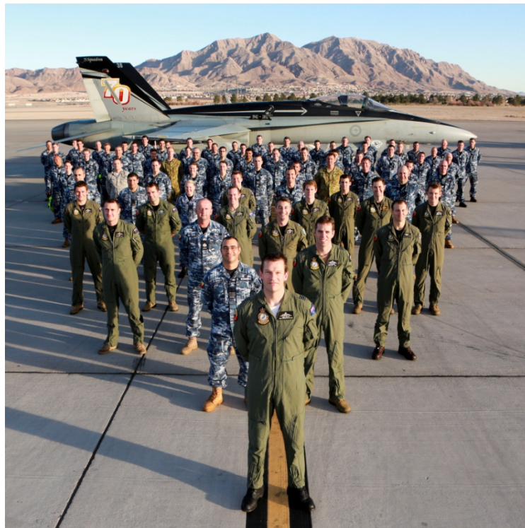
Deployed at Nellis AFB, Las Vegas, for Exercise Red Flag – 16 Feb 16

We returned to work on 04 January and nine days later we were packed into freight containers and airborne heading to Las Vegas for Exercise Red Flag. We took six jets, a KC-30 tanker, plus a C-17, and hopped across the Pacific via Guam and Hawaii; transiting close to some historical sights of significance. Unfortunately all of the military accommodation was booked out, so we had to rough-it in hotels en route. The transit went extremely smoothly, no issues due to well-prepared aircraft, in-fact by the time we arrived in Las Vegas many of the newly posted-in members back at Tindal had not even showed for their first day at work. The Exercise itself was a huge success. Red Flag is the premiere training exercise and environment in the world, and the Magpies represented exceptionally well. Of note, our maintainers, suppliers and armaments staff delivered a 100% serviceability rate, resulting in 100% mission achievement; the most successful Red Flag deployment for 81WG and ACG to date thanks to our dedicated Magpies on the ground. Amazing efforts and teamwork! Much to the disappointment of a handful of maintenance, logistics, administration staff and aircrew, none of jets broke-down in Hawaii or Guam on our way home, so we were unable to extend our hotel stays whilst 'waiting for spares'; it's a small price your pay for keeping the jets in such great condition throughout the exercise.